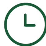
156 cups per hour (single) and 377 cups per hour (twin)